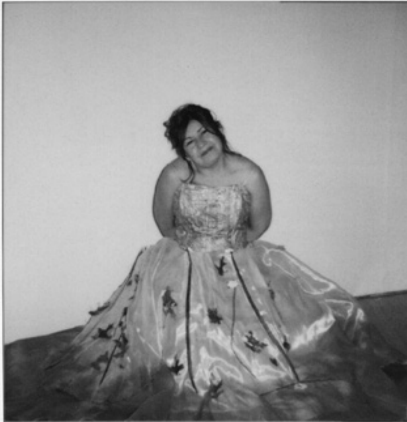
Ms. 50

When sadness takes toll on her, she imagines that she is being photographed and she smiles and strikes a pose. She walks and sings to the lines: “the love tan proble de lou.”