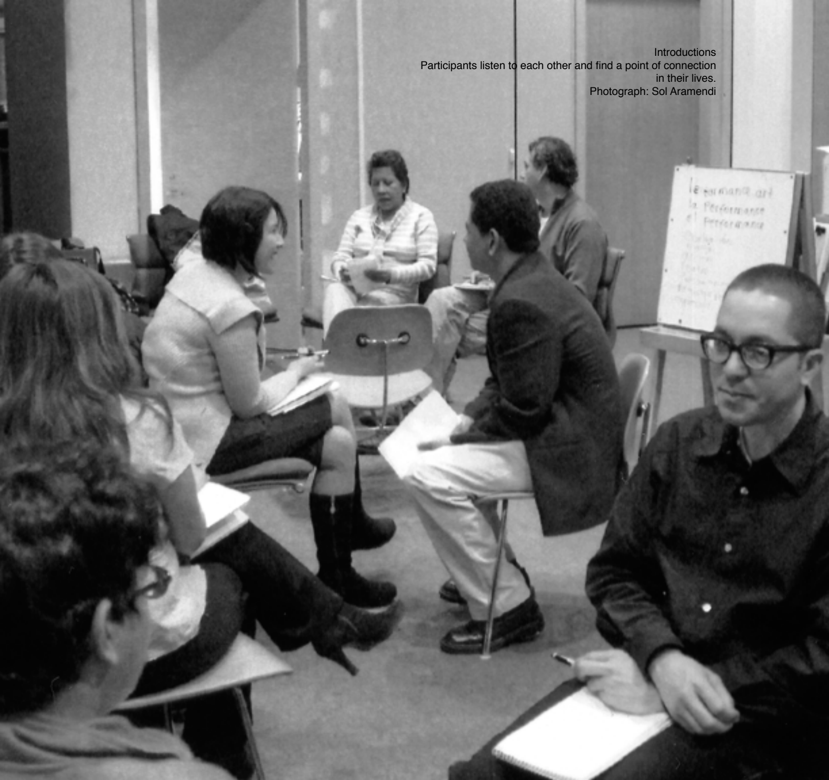
Introductions Participants listen to each other and find a point of connection in their lives.