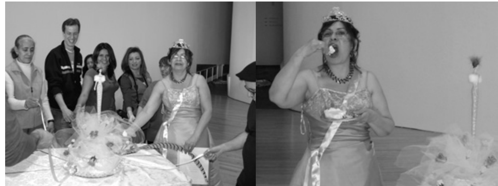
Ms. 50 celebrating with her birthday guests.

The following day, my son called me to tell me he arrived safely and that he was ready for the big celebration, but he forgot his shoes in New York. I arranged for someone to pick him up and went searching for a pair of shoes. If that wasn't enough, the manager of the hall where my party was to take place told me that the party had to begin after eight o'clock because a mass was being held. I had already informed my guests that the party would start at seven. The cherry on top was that I managed to lose my voice for my 50th birthday celebration. I was unable to say more than two words during the extravaganza. But in the end, after all the struggles I went through to make my birthday special ... no one's imagination, not even my own, could have made this birthday more exceptional.